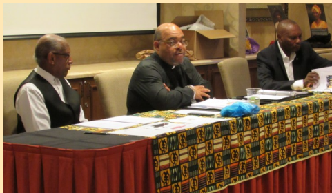
Supporting Black Catholics and advancing African American leadership throughout the Church.

If your Arch/Diocese does not have an Office of Black Ministry and you have a group of individuals who are interested in celebrating our cultural gifts, we invite you to contact us at: nabcainc@gmail.com .