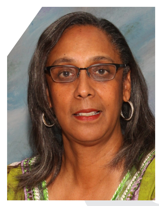
Greetings from Xavier University of Louisiana!

"For Zion's sake I will not keep silent... I will not keep quiet!" Isaiah 62:1